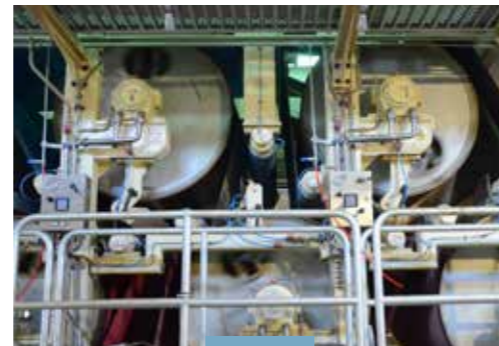
Pressing and drying station