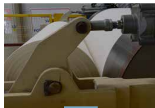
Raw paper jumbo