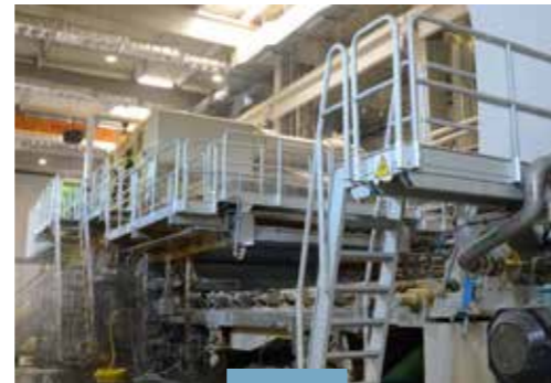
Paper web formation