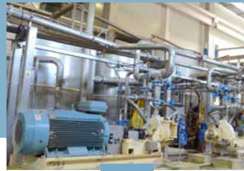
Pulp preparation (Pulper)

THE PAPER IS THE HEART OF EACH MASKING TAPE PRODUCTION BUT EVERY EFFORT WOULD BE USELESS WITHOUT AN EFFECTIVE TECHNOLOGICAL PROCESS