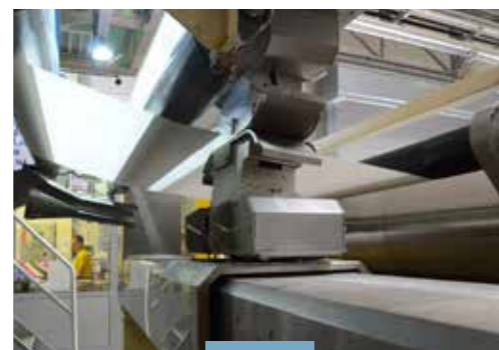
Thickness automatic control